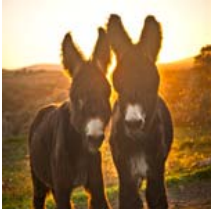
Hard Times for a Small (and Fuzzy) Group