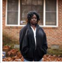
On Register's Other Side, Little to Spend