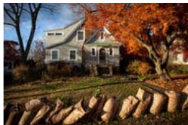
Bags of leaves awaiting pickup in Hastings-on-Hudson.