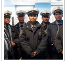
Bangladeshis Build Careers in N.Y. Traffic

© 2013 The New York Times Company | Site Map | Privacy | Your Ad Choices | Advertise | Terms of Sale | Terms of Service | Work With Us | RSS | Help | Contact Us | Site Feedback